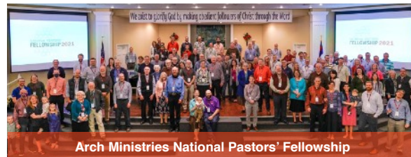
Arch Ministries National Pastors' Fellowship

Also, I had the privilege to attend a National Pastors' Fellowship organized by Arch Ministries in Bradenton, FL. While there, I interacted and shared IPM's Deaf Ministry with other pastors and missionaries. It was an opportunity to meet new people and get reacquainted with others who I met previously at conferences.