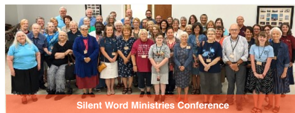
Silent Word Ministries Conference

We continue praying and planning with the pastor of my home church to reach the Deaf in our community. Please pray with us for wisdom to establish a deaf ministry. Twice a month, I attend a deaf Bible study. I thoroughly enjoy the fellowship and sharing of God's Word with this group. We are a group of seven Deaf and 1 Hearing (me). Due to the pandemic, the group has been smaller than usual. We are hoping that more will come to be blessed by the teaching of the Bible. Two members of the group visited my local church recently. They enjoyed the service, the Sunday School class, and the fellowship with other believers. Please pray for those who have not been able to come back yet to the Bible study and those who are already attending.