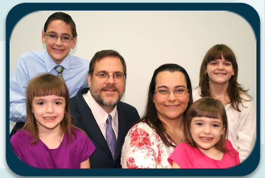
Deaf Team Member